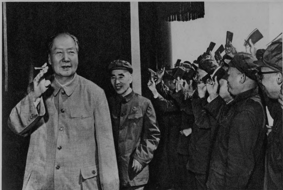
Our great leader Chairman Mao Tsetung and his close comrade-in-arms Vice-Chairman Lin Piao at the Tien An Men rostrum, celebrating the 21st anniversary of the founding of the People's Republic of China together with the armymen and civilians of Peking.