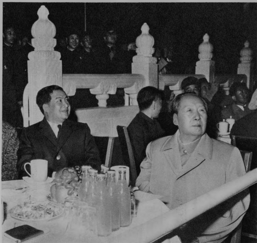
Our great leader Chairman Mao and Samdech Norodom Sihanouk, Head of State of Cambodia and Chairman of the National United Front of Kampuchea, watching the fireworks from the Tien An Men rostrum.