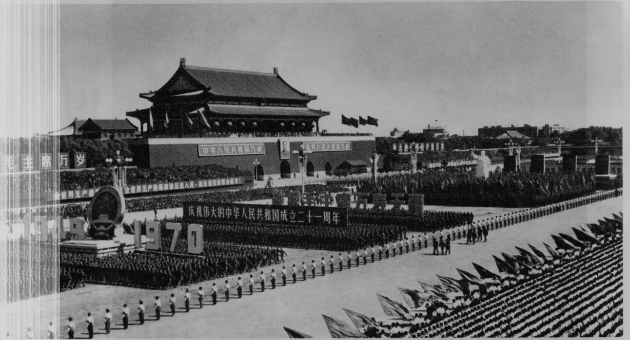
On October 1, several hundred thousand armymen and civilians of the capital took part in the mammoth rally and parade, grandly celebrating the 21st anniversary of the founding of the People's Republic of China.